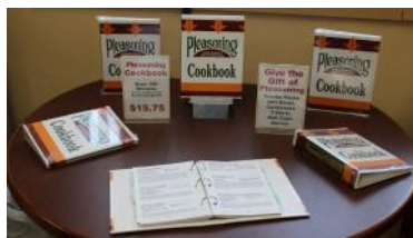
Pleasoning Cookbook page 19

Combine all ingredients in a large kettle. Bring to boil, cover and simmer for 3 hours. Remove chicken and cut chicken from bones. Add your favorite vegetables and pasta for a delicious soup! No need for soup base or bouillon cubes!